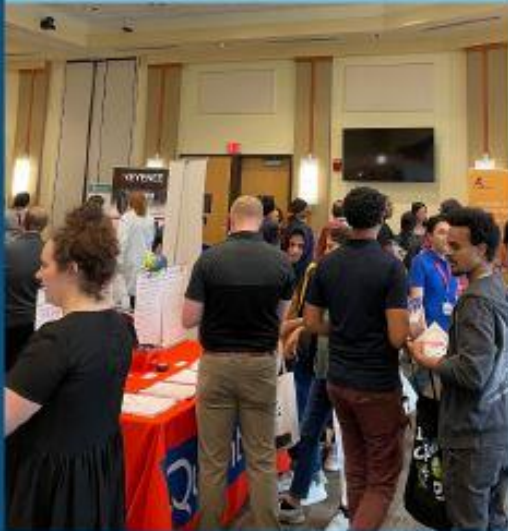
Exhibit With LSE